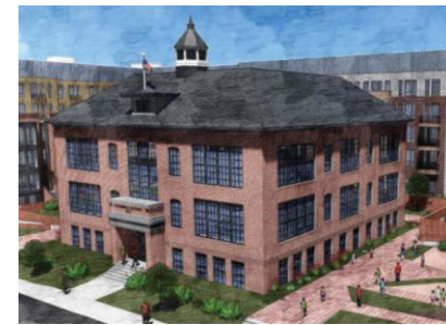
Crummell School - Ivy City