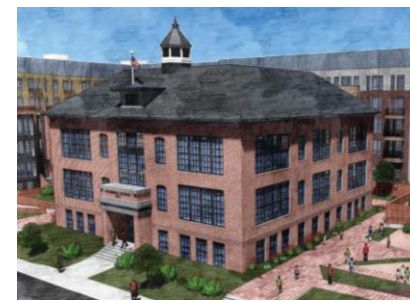
Crummell School - Ivy City