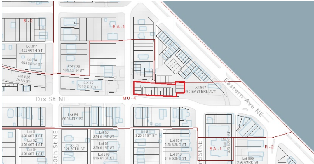
Figure 1: Development Parcels Map. Map not to scale.