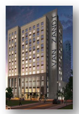
Hotel Van Zandt (Austin, TX)