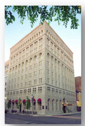
Courtyard by Marriott (Washington, DC)