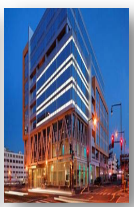
Half Street (Washington, DC)