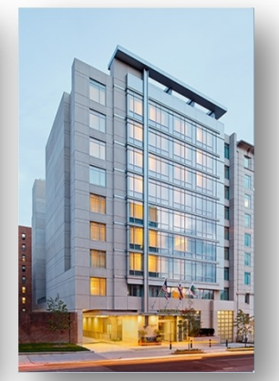
Courtyard Marriott (Washington, DC)