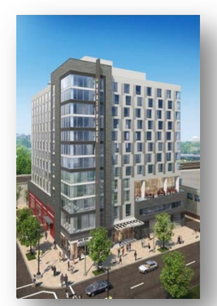
400 E Street Hotel and Fire Station (Washington, DC)