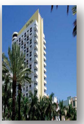
The Royal Palm Hotel (Miami, FL)