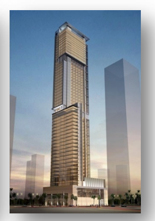
Hyatt Doha (Doha, Qatar)