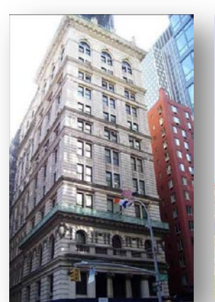
346 Broadway (New York, NY)