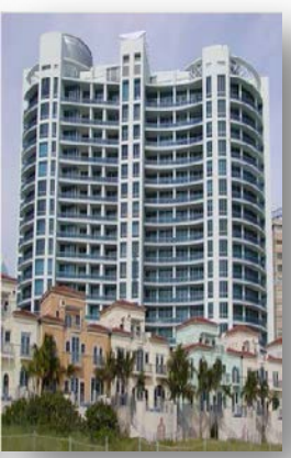
The Bath Club (Miami, FL)