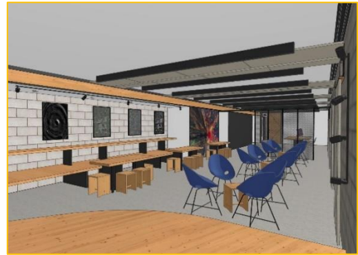
Rendering of part of Loops community space.