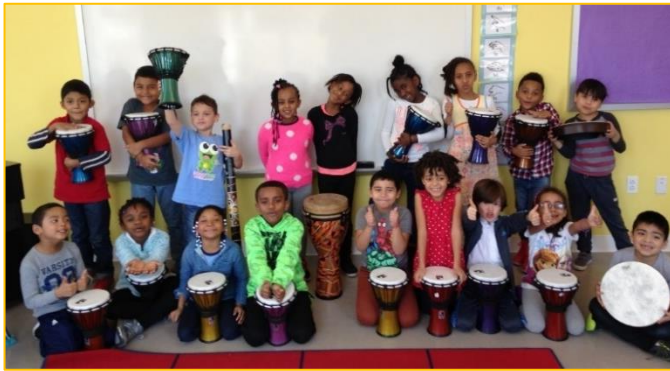
Kids learning music at a Loops Foundation program.