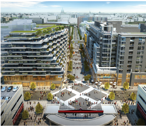
Half Street development in Capitol Riverfront

Washington, DC is one of the hottest real estate markets in the U.S. DC's population growth and public and private investments can be experienced throughout the city. National accolades have followed with several neighborhoods being recognized as great places to live, visit and invest. Current real estate development projects seeking FDI include: