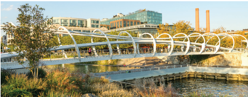
Yards Park in Capitol Riverfront