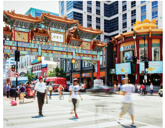
Friendship Archway in Chinatown