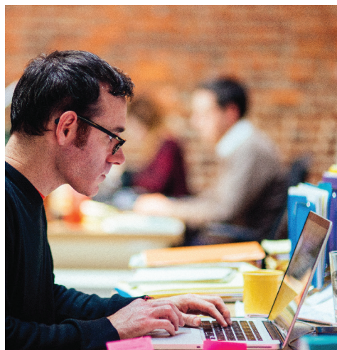
DC is the #3 City for Tech Talent (CBRE Group, 2018)

equity firms and nearly 20 federal labs with commercialization opportunities