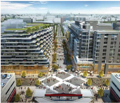
Half Street development in Capitol Riverfront

Washington, DC is one of the hottest real estate markets in the U.S. DC's population growth and public and private investments can be experienced throughout the City. National accolades have followed with several neighborhoods being recognized as great places to live, visit and invest. Current real estate development projects seeking FDI include: