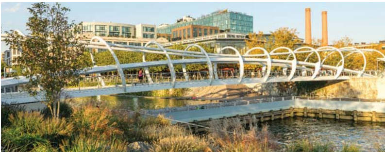
Yards Park in Capitol Riverfront