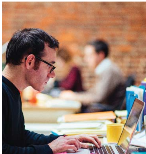
DC is the #3 Tech City in the U.S. (Cushman & Wakefield, Tech Cities 1.0)

Washington, DC boasts an active technology sector focused on software development, systems integration, and consumer internet products. DC offers access to countless customers such as federal agencies, international nongovernmental organizations, and major corporations in finance and hospitality. With over 200 tech startups pioneered in DC, and festivals like Digital Capital Week which attracts 10,000 attendees, the District of Columbia is attracting technology entrepreneurs from throughout the region. DC's active urban culture, educated population, and boundless professional opportunities attract talented engineers, sales, and marketing experts.