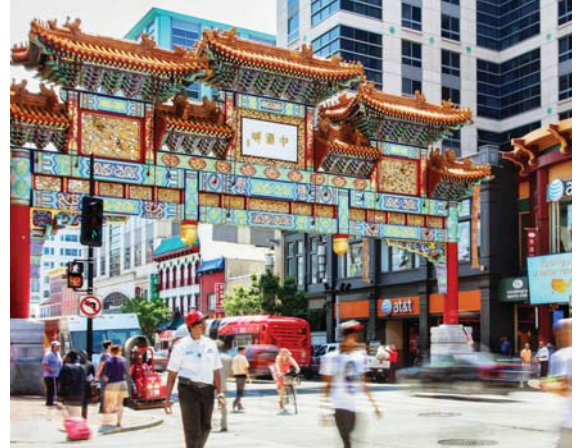
Friendship Archway in Chinatown