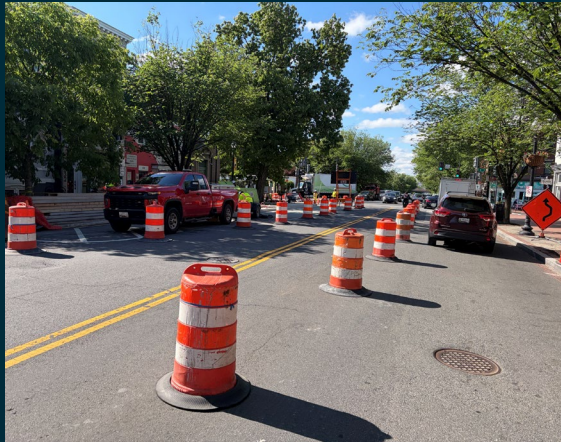
Construction: SB 8 th and G St