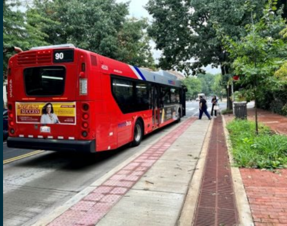
Bus Stop Bulb Out Example