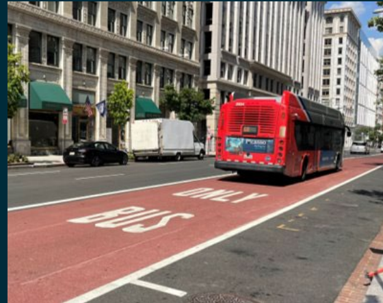
Bus Lane Example