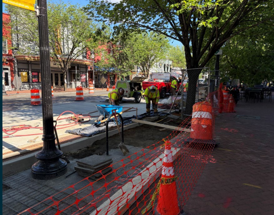
Construction: NB 8 th and G St